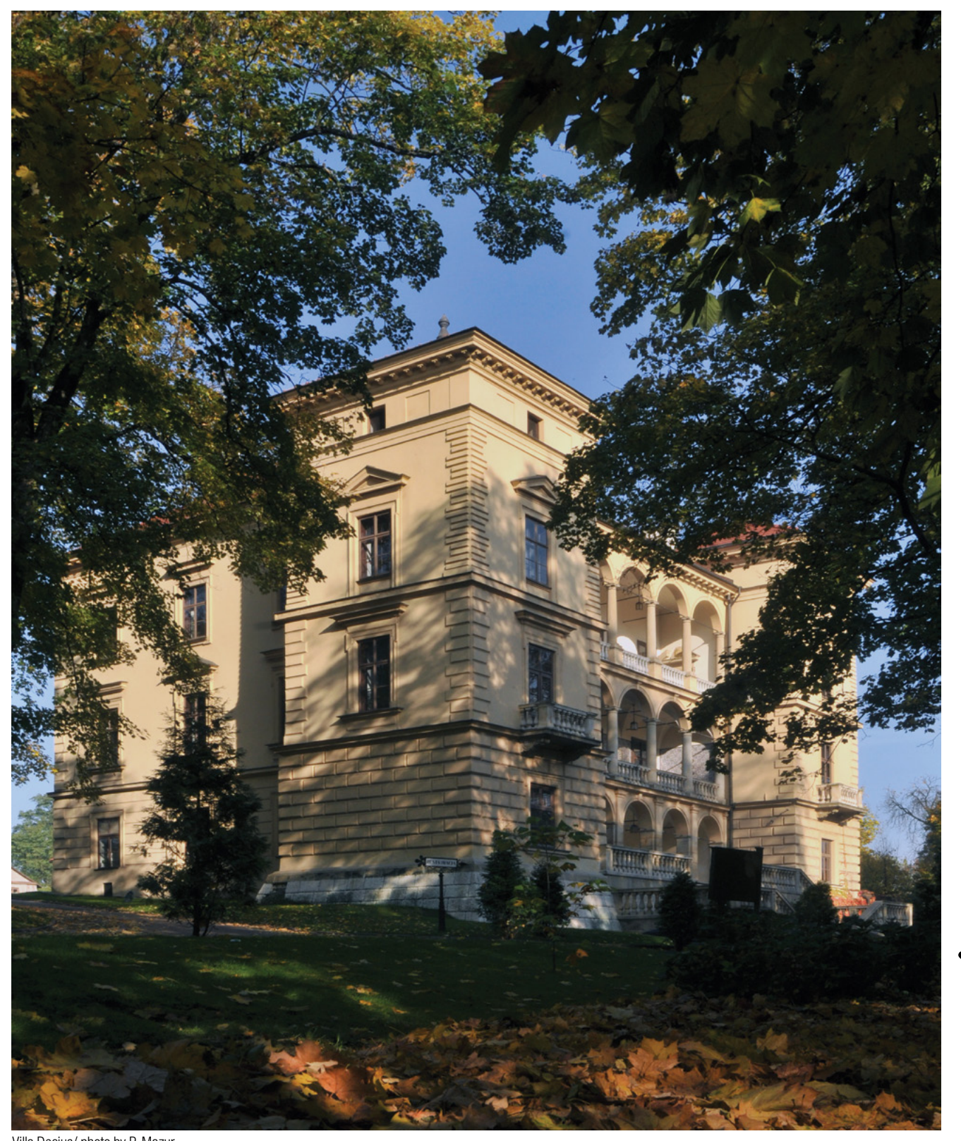
Since the Villa Decius rose from the ruins, Kraków has become a slightly different town.

As if in a house full of beautiful old furniture, someone put a bouquet of fresh, colourful flowers on a piece of it.